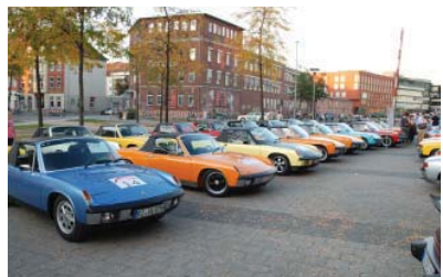
VW-Porsche 914 Meeting in Münster

In early 1981, the VW-Porsche 914 Club Deutschland e.V. is founded. At the end of the year, the VW-Porsche 914 Club Schweiz is established.