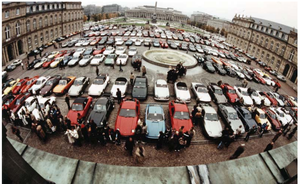
Porsche Parade Deutschland 1982

This step was marked by the first Porsche Parade Deutschland from the 29th to 31st October 1982 in Stuttgart. Ferry Porsche welcomed 800 Club members and 400 Porsche cars to Stuttgart. Today, Porsche Club Deutschland e.V. has more than 6,800 members in 90 regional Clubs. Its principal event of the year is known as the "Porsche Deutschland Treffen" (Porsche Germany Meeting).