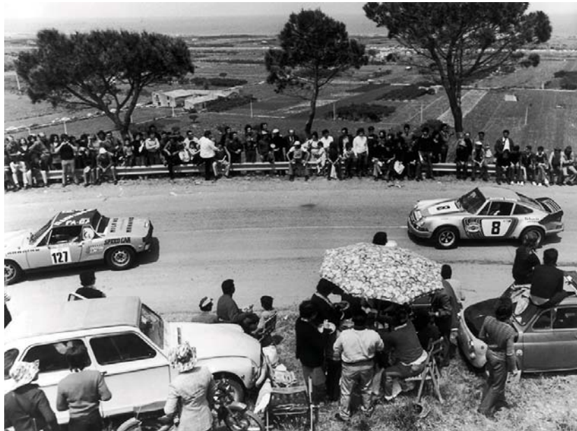
The final Targa Florio 1973: An overall victory for Porsche

1974 — 22 years have now passed since the first Porsche Club was founded. The Porsche 356 has become a collector's item. In consequence, lovers of