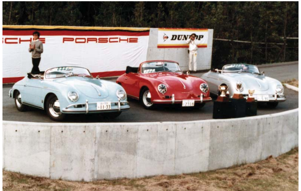
Far-East: Porsche Parade in Japan in the 1980s

In August 1975 , the 917/30 once again made headlines when Mark Donohue set a lap record that remains unbeaten to the present day on the oval circuit of Talladega in Alabama: the American drove the fastest lap, with an average speed of 355.85 km/h.