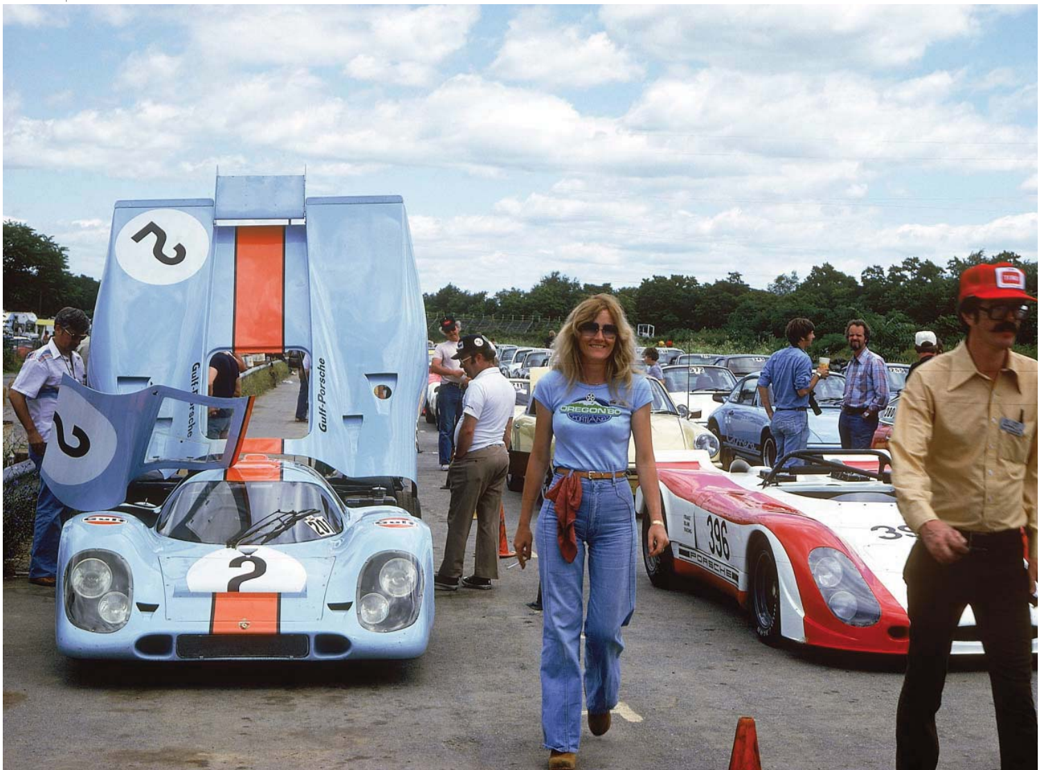
Keep on Rollin': in 1975, the cars were not the only things that were brightly coloured. Above all, along with the various racing cars, the Porsche Parade USA featured every version of the 911

Part 3 of our series highlights the period from 1973 to 1982 – from the G-model to the advent of the Porsche Club Coordination and the foundation of the national umbrella organisation in Germany.