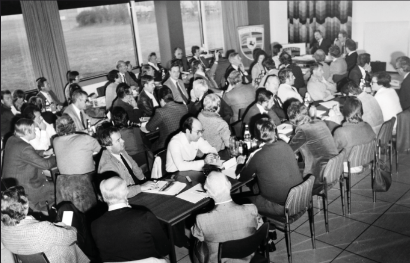
The meeting of Club Presidents in Ludwigsburg in 1978 (above), Porsche celebrates 25 years of "driving at its most beautiful" (right)