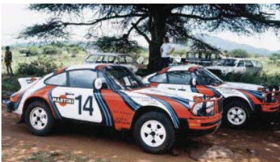
911 SC at the East African Safari in 1978