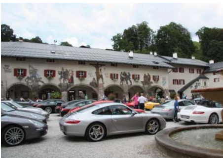
Porsche Deutschland Treffen 2011 at Berchtesgaden