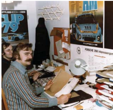
1980: The office of the 356 IG