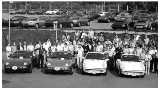
1980 Porsche Club Sverige's factory visit

The 924 Carrera GTP , with a 2.0-litre turbo engine producing 320 hp, is among the prototypes competing in Le Mans.