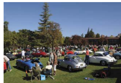
Westcoast Holiday of the 356 Registry